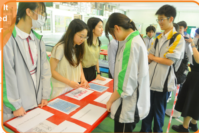
Ice Cream Redemption

Last week, I joined Ice Cream Day. I could eat chocolate ice cream. It made me feel interested and excited. Thanks for the activity.