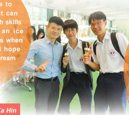
Ice Cream Joy

It is a great idea to have Ice Cream Day. It can improve students' English skills and students can get an ice cream with their coupons when they do well in class. I hope that there will be Ice Cream Day next year.