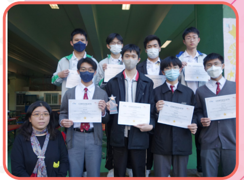
中五同學獲職業訓練局及鵬程慈善基金「STEM in PE設計比賽創意大獎」銅獎