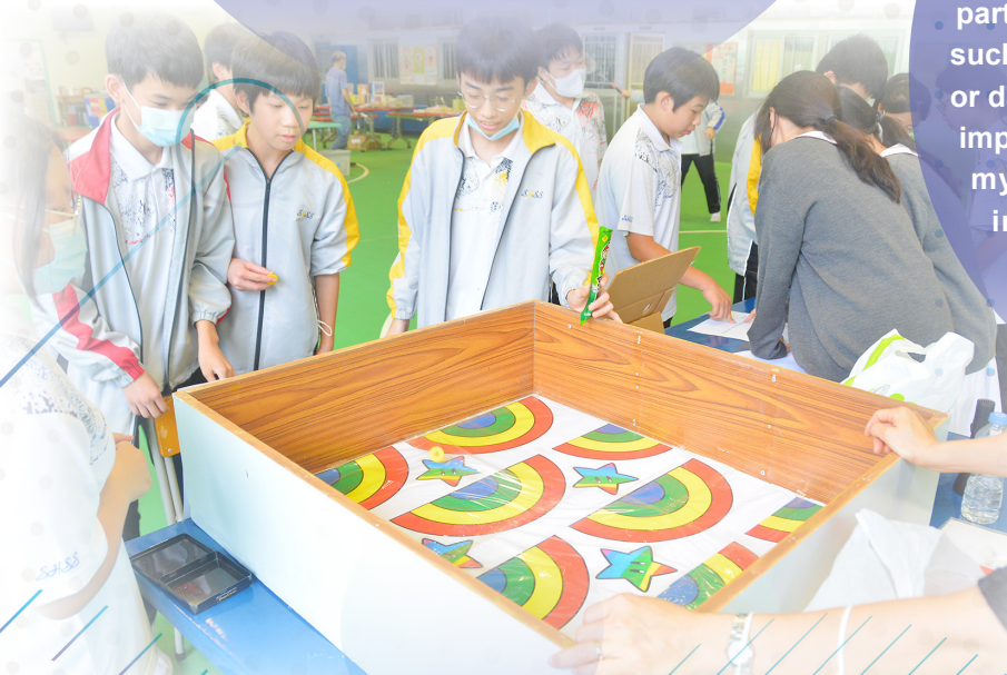
Rainbow Coin Toss Game

The school's English Day was fantastic! Some fantastic English songs were played on the school radio during lunchtime. I also participated in all kinds of fun booth games, such as the rainbow coin toss game and truth or dare wheel. This day not only allowed me to improve my English skills but also deepened my interest in English. I was immersed in English all day long. I am looking forward to more interesting English activities next year!